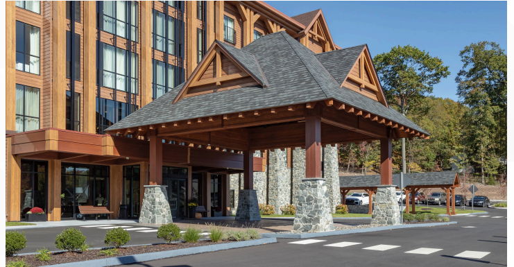
BYS 13037 Custom Porte Cochere