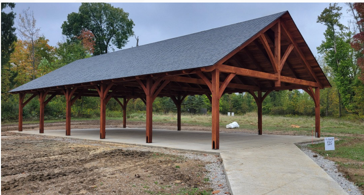
BYS 17501 30x60 Moritse & Tenon Timber Pavilion