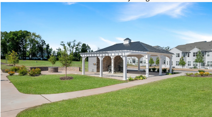
BYS 2866 20x32 Vinyl Pavilion and Pergola