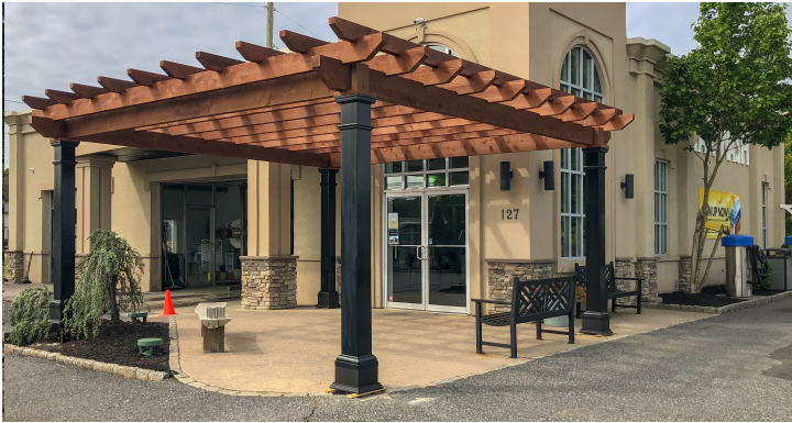
BYS 107 18x18 Cedar Timber Pergola