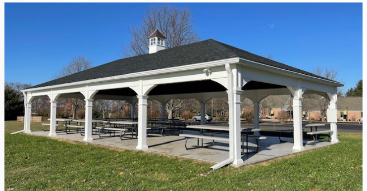
BYS 10674 26x50 Vinyl Pavilion