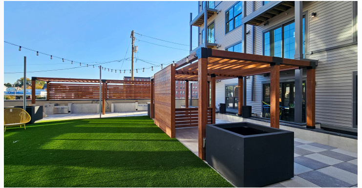
BYS 16890 Pine Modern Pergolas