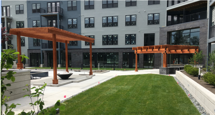
BYS 3920 Custom Cedar Pergolas