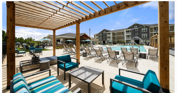
BYS 11595 Cedar Modern Pergolas