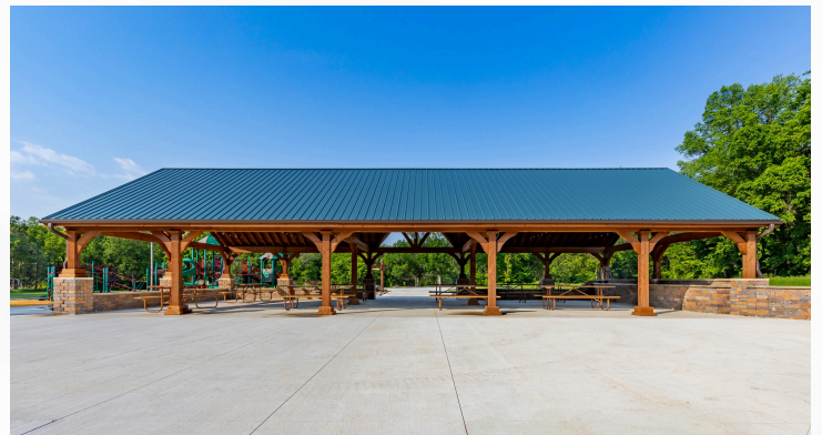
BYS 11390 30x66 Cedar Timber Pavilion