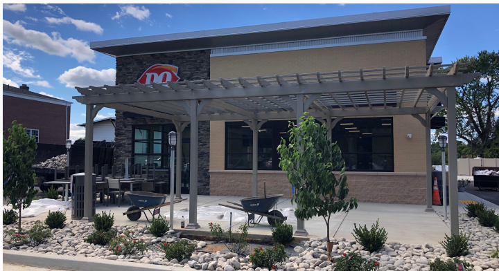
BYS 12515 14x26 Vinyl Pergola