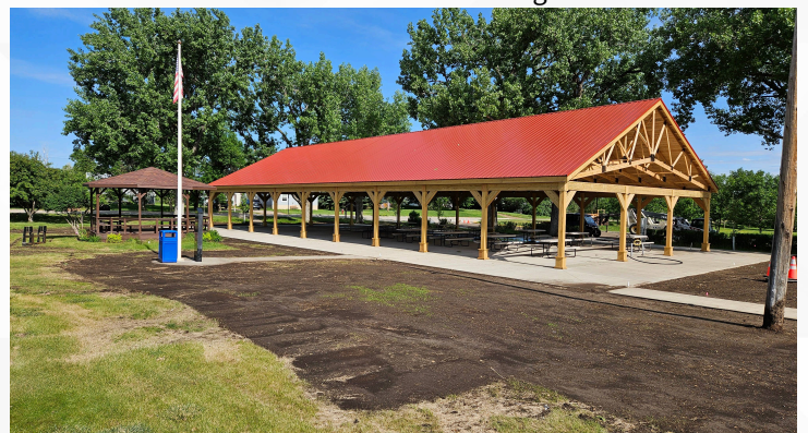
BYS 12785 46x104 PT Truss Pavilion