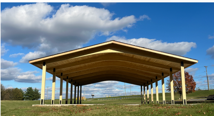
BYS 13450 32x60 PT Wood Park Model