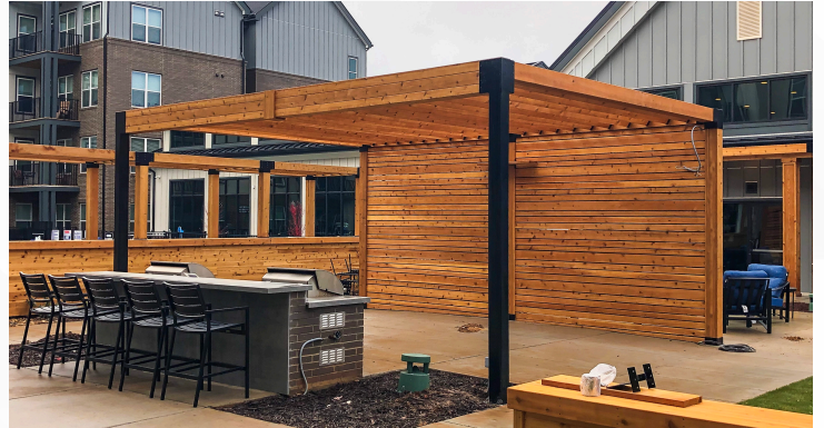
BYS 4406 Custom Cedar Pergola