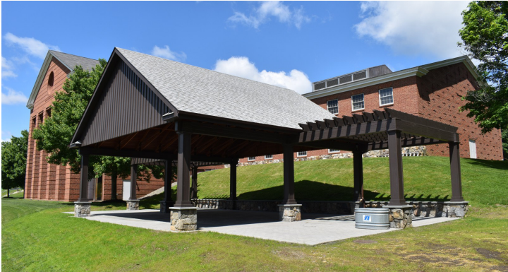
BYS 12904 Custom Cedar Pavilion