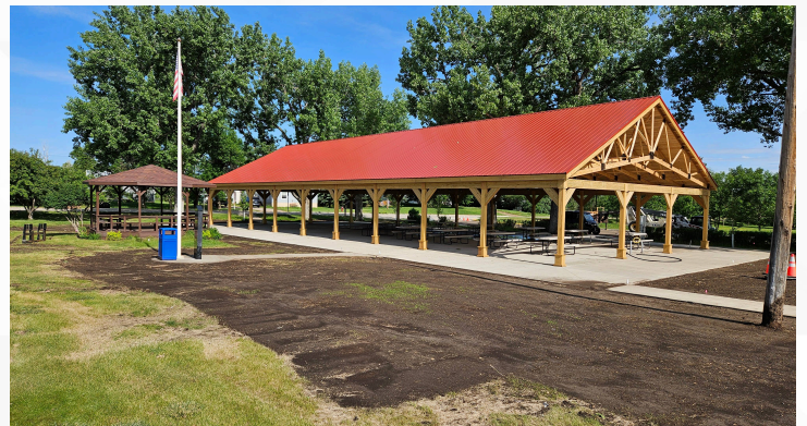
BYS 12785 46x104 PT Truss Pavilion