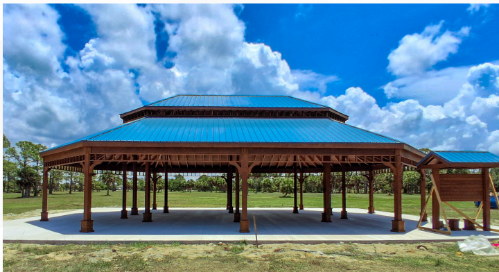
BYS 13771 40x60 PT Gazebo